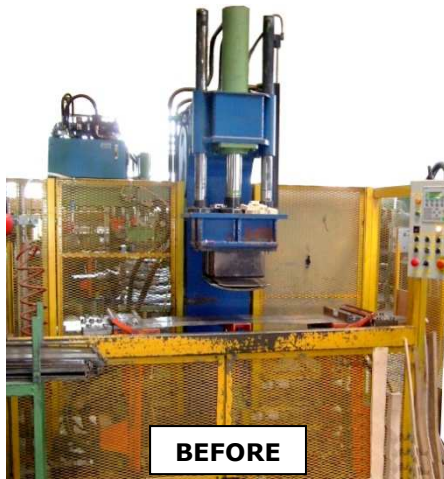
Revamping of a Bending System